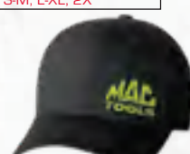
HI-VIS FLEXFIT® LOGO HAT