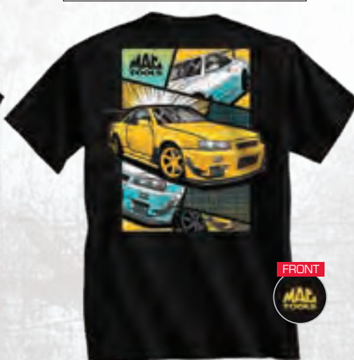
IMPORT TABLEAU TEE

Z0136TEE M, L, XL, 2X, 3X $40.99 4X, 5X $47.99