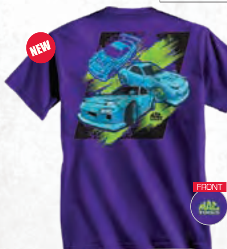
90'S STREET STREAK TEE