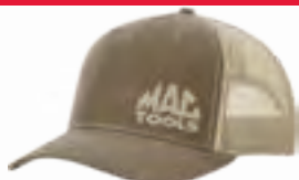
RICHARDSON WAXED CANVAS HAT