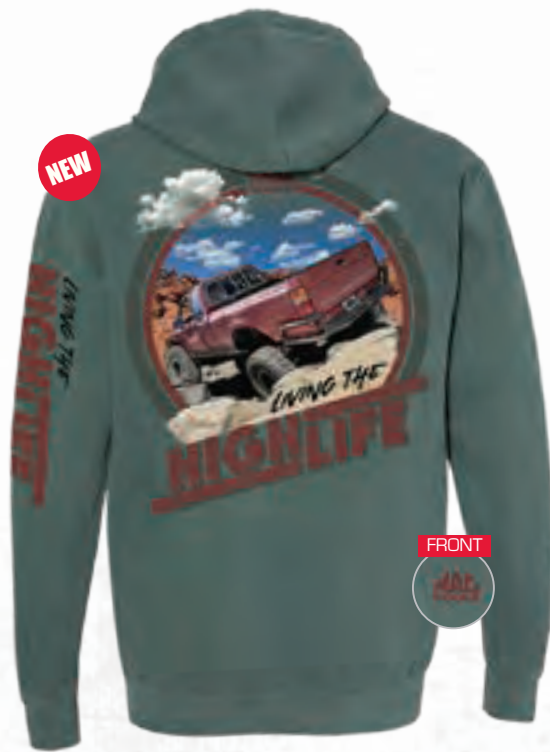
HIGH LIFE HOODIE

Z0164FLC M, L, XL, 2X, 3X $107.99 4X, 5X $114.99