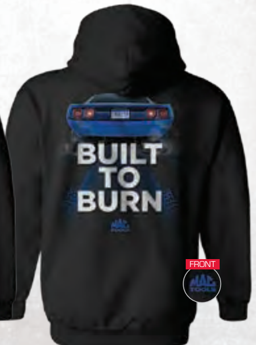
BUILT TO BURN HOODIE

Z0145FLC M, L, XL, 2X, 3X $107.99 4X, 5X $114.99