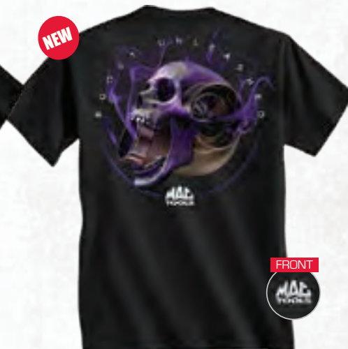
BOOST UNLEASHED TEE

Z0162TEE M, L, XL, 2X, 3X $40.99 4X, 5X $47.99