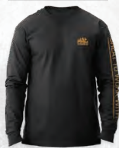
LONG SLEEVE PERFORMANCE TEE

Z0146TEE M, L, XL, 2X, 3X $40.99 4X, 5X $47.99