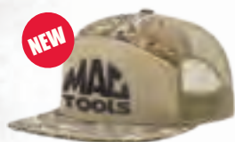
REAL TREE CAMO HAT