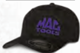
BLACK FLEXFIT® HAT WITH PURPLE DOME LOGO