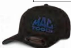
BLACK FLEXFIT® HAT WITH BLUE DOME LOGO