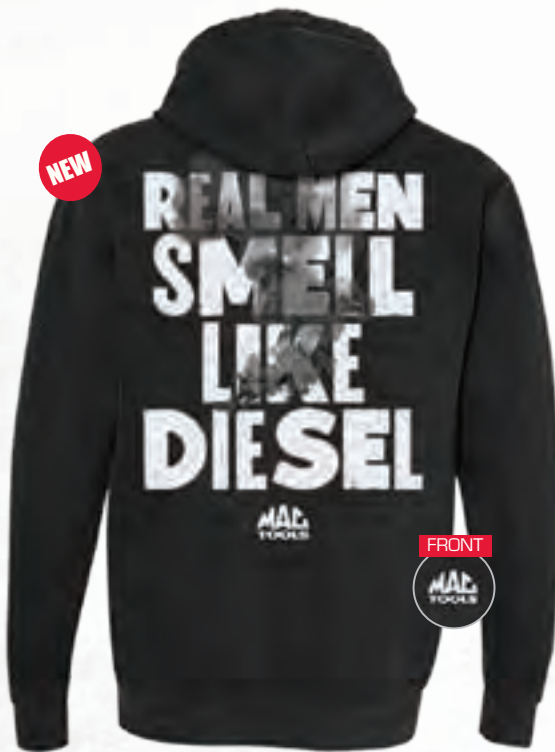
REAL MEN SMELL LIKE DIESEL HOODIE