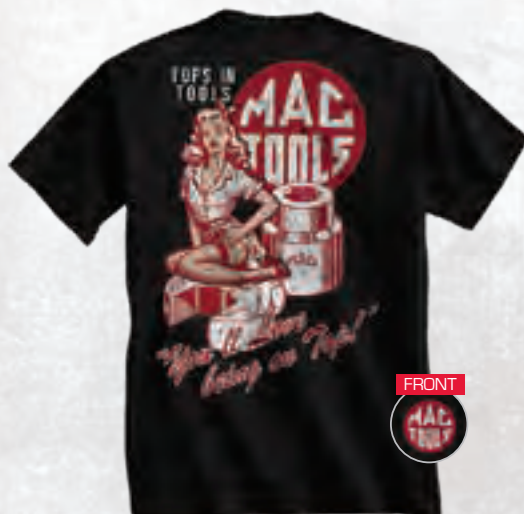
RETRO PINUP TEE

Z0157TEE M, L, XL, 2X, 3X $40.99 4X, 5X $47.99