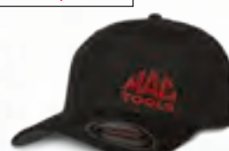
FLEXFIT® W/ RED DOME LOGO