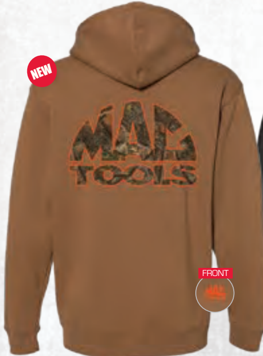
CAMO LOGO HOODIE

Z0163FLC M, L, XL, 2X, 3X $117.99 4X, 5X $121.99