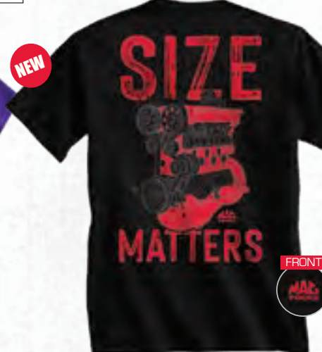
SIZE MATTERS TEE

Z0160TEE M, L, XL, 2X, 3X $48.99 4X, 5X $53.99