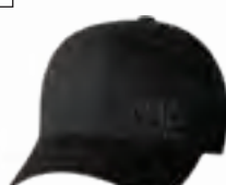
FLEXFIT® BLACK LOGO HAT