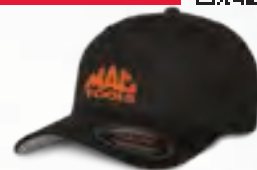
BLACK FLEXFIT HAT W/ ORANGE DOME LOGO