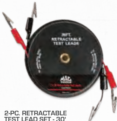
2-PC. RETRACTABLE TEST LEAD SET - 30'