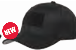
HAT WITH 3-PK. VELCRO PATCHES • 100% Cotton hat with velcro patch • Includes 3 interchangeable woven patches • Patch size - 3.25" x 2" A0030HAT $50.99