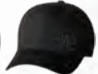
FLEXFIT BLACK LOGO HAT • Embroidered Logo X0083 $41.99 S, M, L, XL, 2X