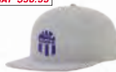
BADGE DOME LOGO HAT • Stretch performance fabric • Embroidered logo A0078HAT $50.99