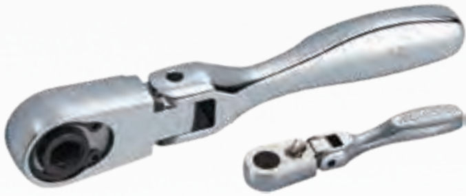
1/4" MINI FLEX BIT RATCHET