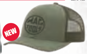
RICHARDSON TRUCKER WITH EMBROIDERY • 60% Cotton, 40% Polyester • Snapback closure • Embroidered logo A0102HAT $48.99