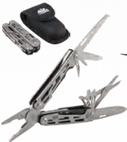
13-IN-1 MULTI-FUNCTION TOOL