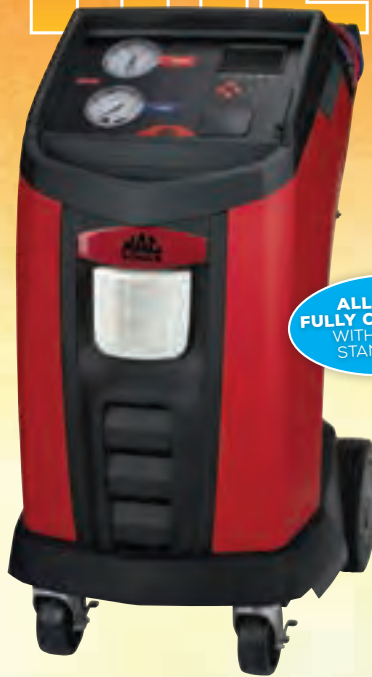
RECOVERY, RECYCLING, AND RECHARGING UNIT FOR R1234YF A/C SYSTEMS