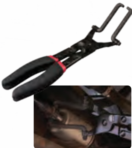
FUEL LINE PLIERS