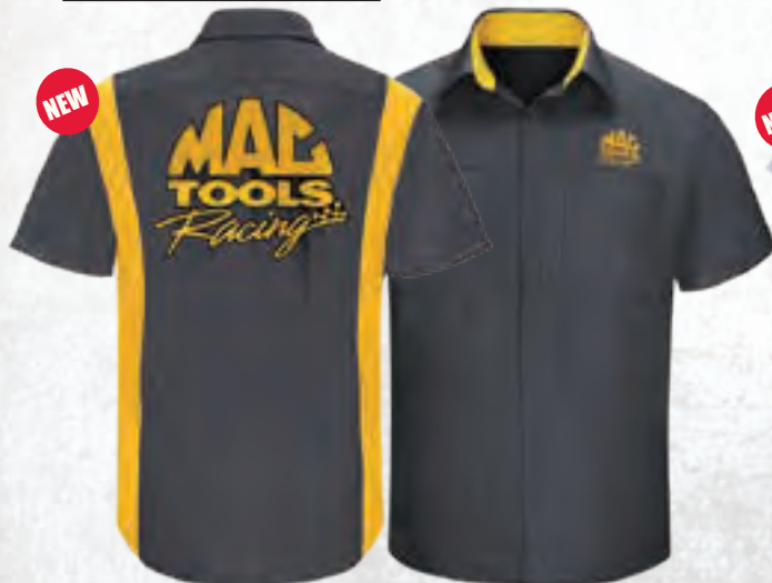
RACING WORKSHIRT • Industrial-friendly ripstop fabric • Moisture management • Utility pocket on sleeve • No-scratch button-front placket A0119WRK M, L, XL, 2X, 3X $109.99 4X, 5X $116.99