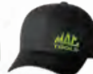
FLEXFIT HI-VIS LOGO HAT • Embroidered Logo N6002 $41.99 S, M, L, XL, 2X