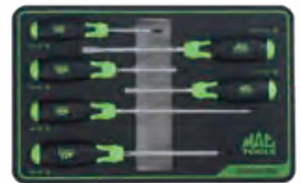
6-PC. SCREWDRIVER SET IN FOAM