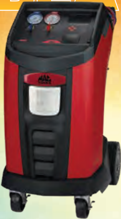
R134A SEMI-AUTOMATIC AC REFRIGERANT MACHINE