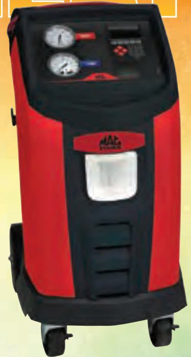
A/C AUTOMATIC R-134A RECOVERY UNIT

ALL UNITS FULLY COMPLIANT WITH J-2788 STANDARDS