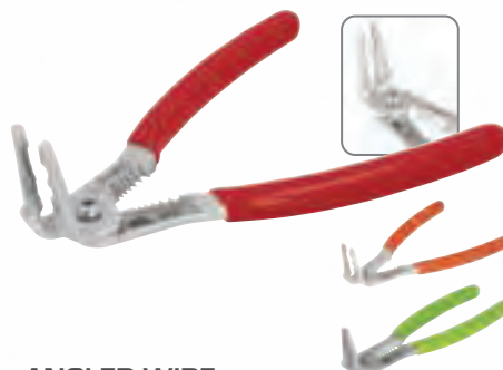
ANGLED WIRE CRIMPER/CUTTER/STRIPPER