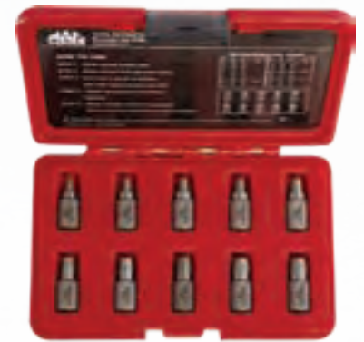
10-PC. MULTI-SPLINE SCREW EXTRACTOR SET