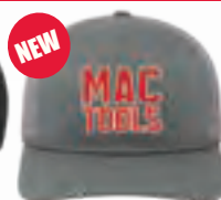
ROPE TRUCKER HAT • Cotton blend hat • Snapback closure • Embroidered logo A0118HAT $48.99