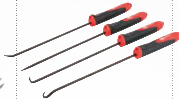
4-PC. LED LIGHTED HOOK AND PICK SET