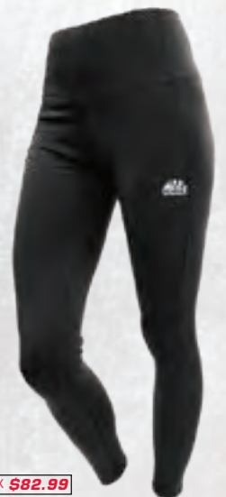
WOMEN'S EVERYDAY LEGGING • Comfortable fit with extra soft fabrication • 28" Inseam • High rise • True to size X0001 S, M, L, XL, 2X, 3X $82.99

Richardson is registered trademark of Richardson Cap Company, Inc., Flexfit is a registered trademark of Flexfit LLC.